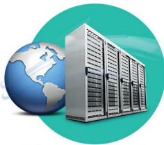
A web server

A Cloud based Telematics Server consists of the following components: