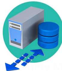
An application Server